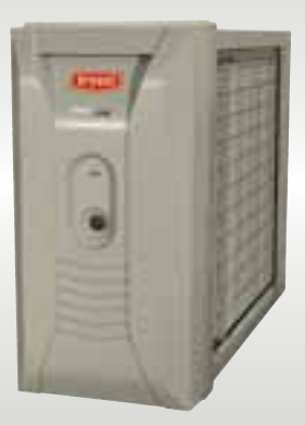
Perfect Air ™ Purifier Gas Furnace Model